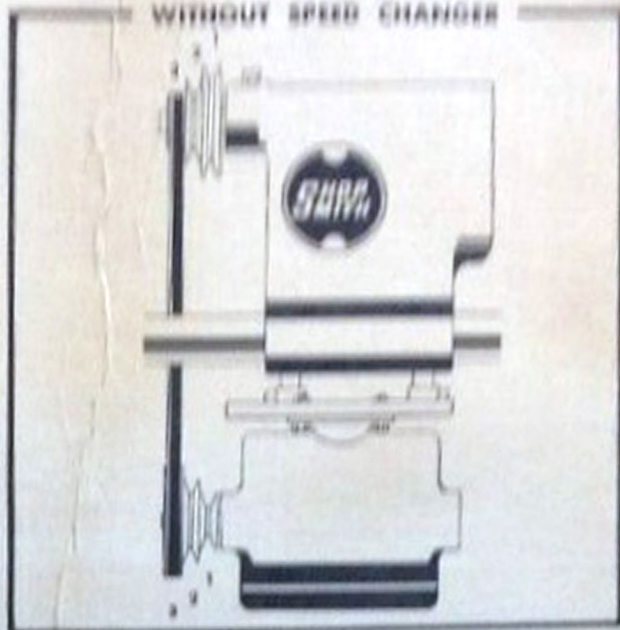
WITHOUT SPEED CHANGER