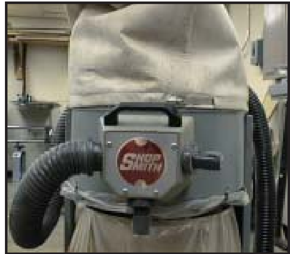
Figure 1 - This is the Shopsmith DC3300 with the New Handle RetroFit Kit attached to the 3-way inlet.